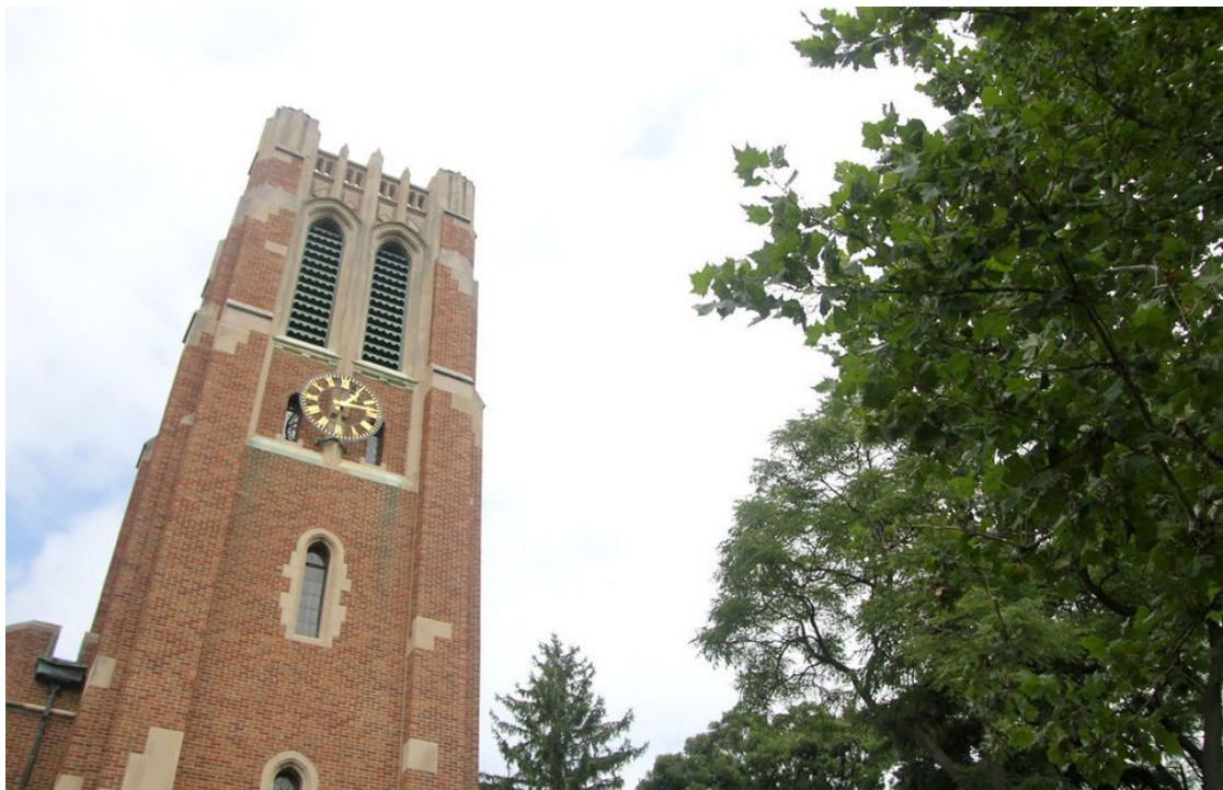
The Beaumont Memorial Tower on the campus of Michigan State University in East Lansing, Michigan.